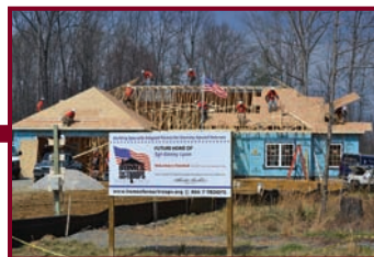
4/1/11 at 1:00 p.m.