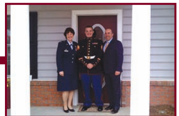
4/9/11 at 11:00 a.m.