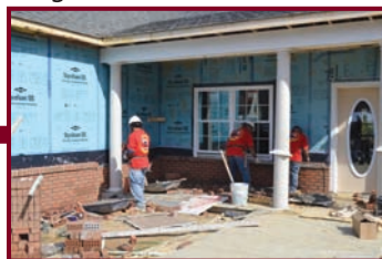
4/2/11 at 11:00 a.m.