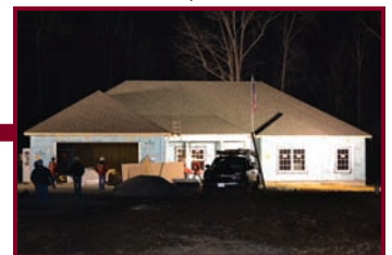
4/2/11 at 2:00 a.m.