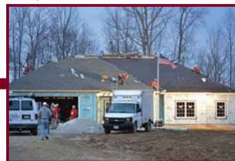
4/1/11 at 8:00 p.m.