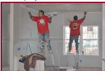
4/2/11 at 10:00 a.m.

"Homes for Our Troops is extremely proud of our commitment to build 100 MORE...Homes for Our Troops over the next three years," said Gonsalves. "We definitely have our work cut out for us, but with the strength of our leadership behind us and the support of such outstanding companies such as Atlantic Builders, we can accomplish anything and truly be able to show our appreciation for our servicemen and women."