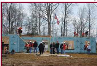
4/1/11 at 10:30 a.m.

“Saying ‘thank you’ just seems like so little when so much has been given back to me,” he confessed, during the historic home build in April, which marked the 100 th home started by Homes for Our