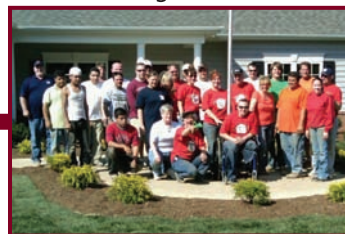
4/4/11 at 1:00 p.m.