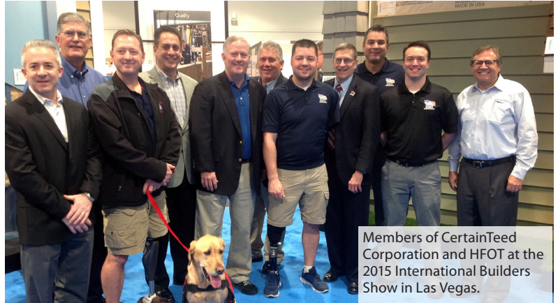
Members of CertainTeed Corporation and HFOT at the 2015 International Builders Show in Las Vegas.

CertainTeed Corporation has increased its commitment to assisting Homes for Our Troops with more products to build specially adapted homes for severely injured Veterans across the nation. The company's contribution now includes roofing, insulation and gypsum wallboard for all HFOT homes, ensuring that homeowners will enjoy a lifetime of indoor comfort.