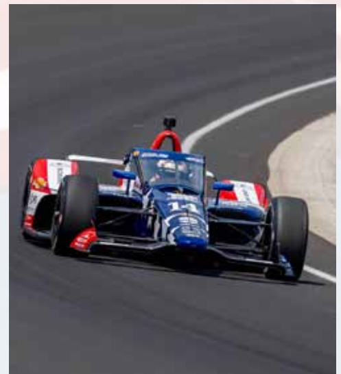
ON THE COVER: Homes For Our Troops at the Indy 500! See page 7.