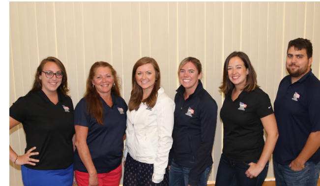
The Community Outreach and Fundraising Teams at HFOT.

Two teams at HFOT serve as its "boots on the ground," and are tasked with creating awareness about our cause at the local level and engaging communities to rally behind each Veteran's home build project.