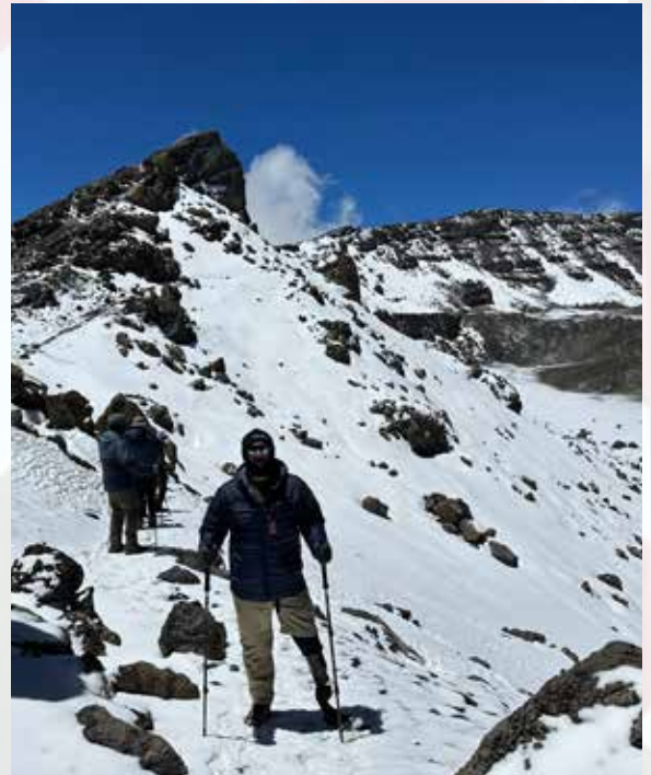
ON THE COVER: Three HFOT Veteran home recipients are "Reaching New Heights", see page 5.