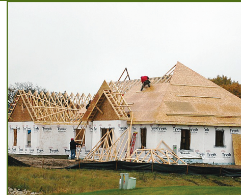
EAGLE, WISCONSIN October 21, 22, and 23, 2009 GC: Kain Construction, LLC

HFOT thanks the General Contractor and the many skilled/unskilled Volunteers on every one of these projects!