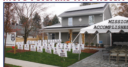
CPL VISNU GONZALEZ Hillsdale, NJ (KC: November 10) GC: Godsil Construction