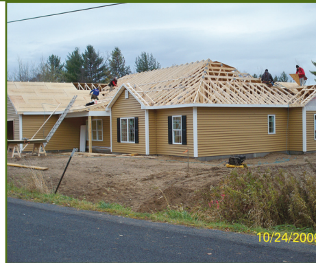
CARTHAGE, NEW YORK October 21, 22 and 23, 2009 GC: Olley's General Contractors, LLC